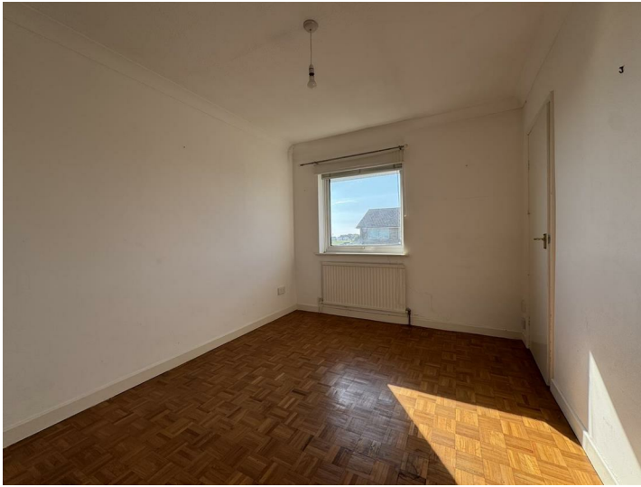
BEDROOM 3 / STUDY 9'2" x 7'3" (2.81 x 2.22) Double glazed window. Radiator. Parquet floor.